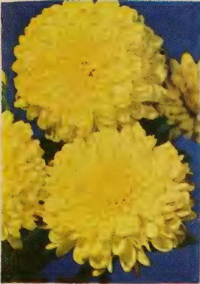
GOLDEN HOURS. 50c each; 3 for $1.25